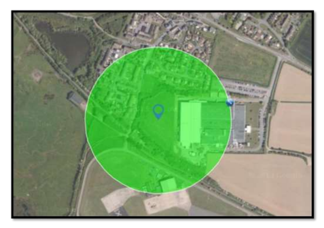
Figure 12 200m radius around Perrigo site