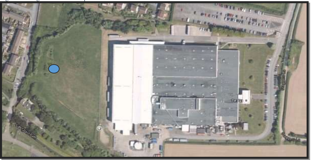
Figure 8 Perrigo small turbine option

A possible location for a smaller turbine is shown by the blue dot. This land is not used by the site owner. The small area of land has outline planning permission – but has done so for 20 years.