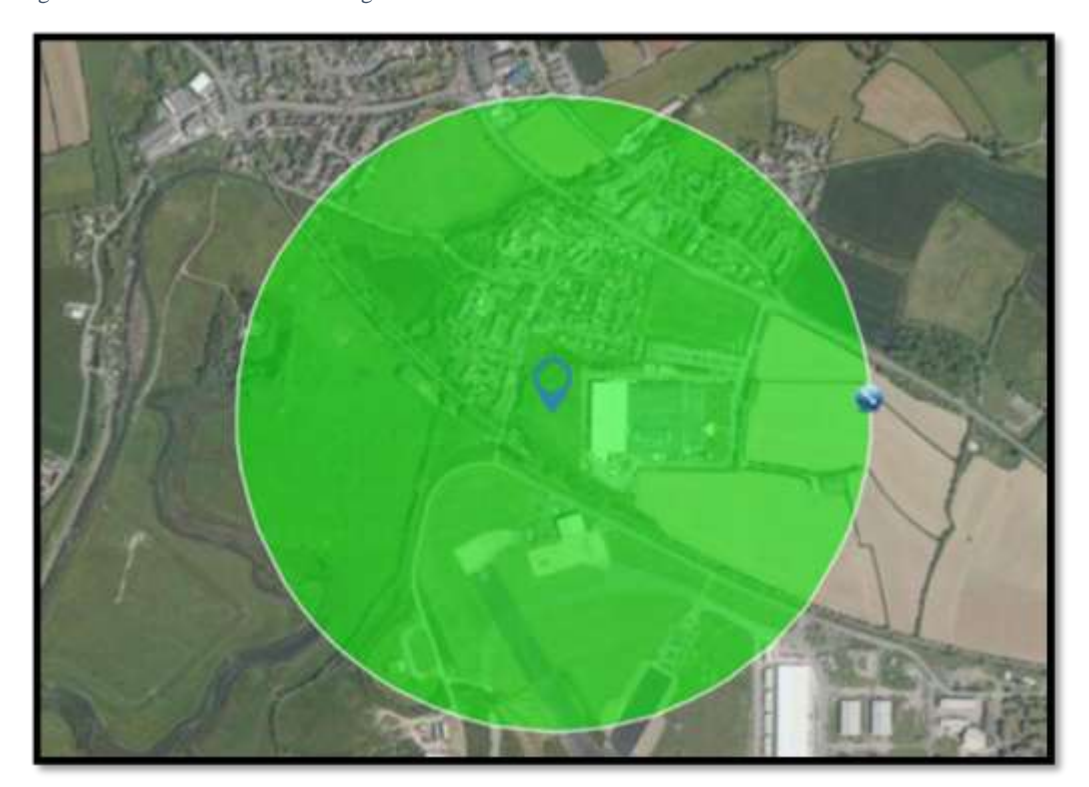
Figure 13\ 500 \mathrm{m} radius around Perrigo site