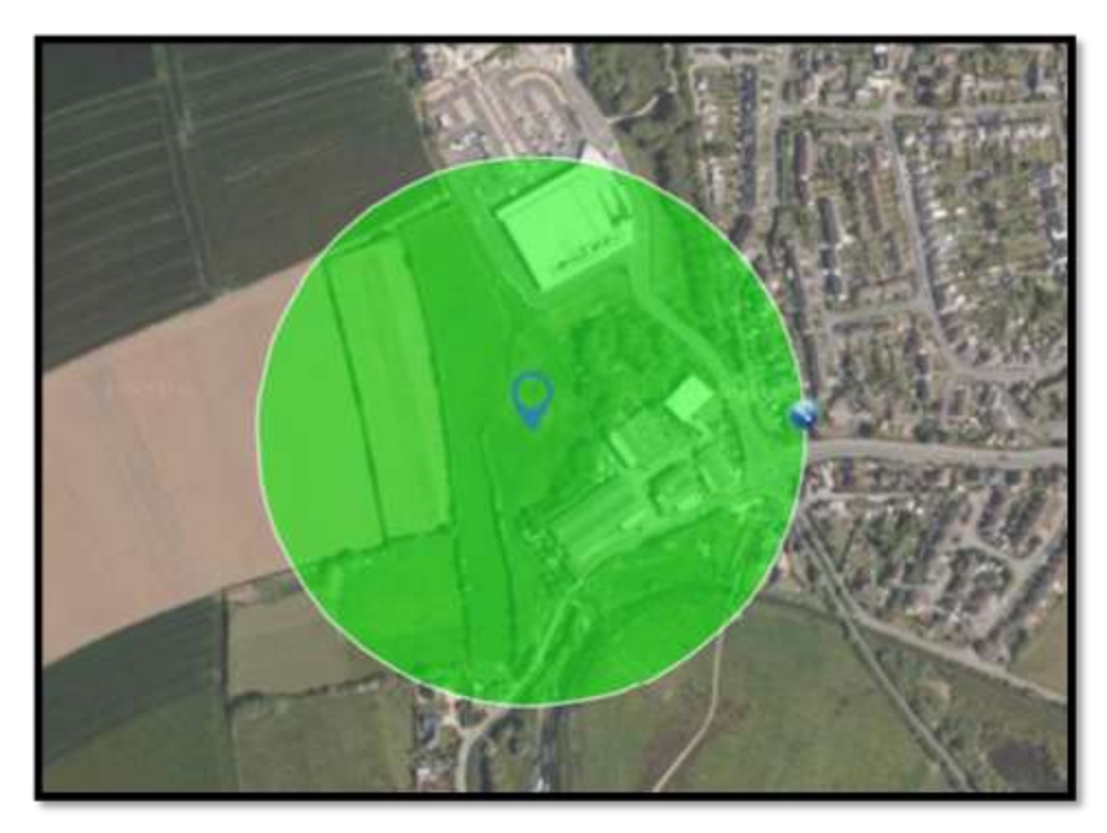
Figure 10 200m radius around Velator site