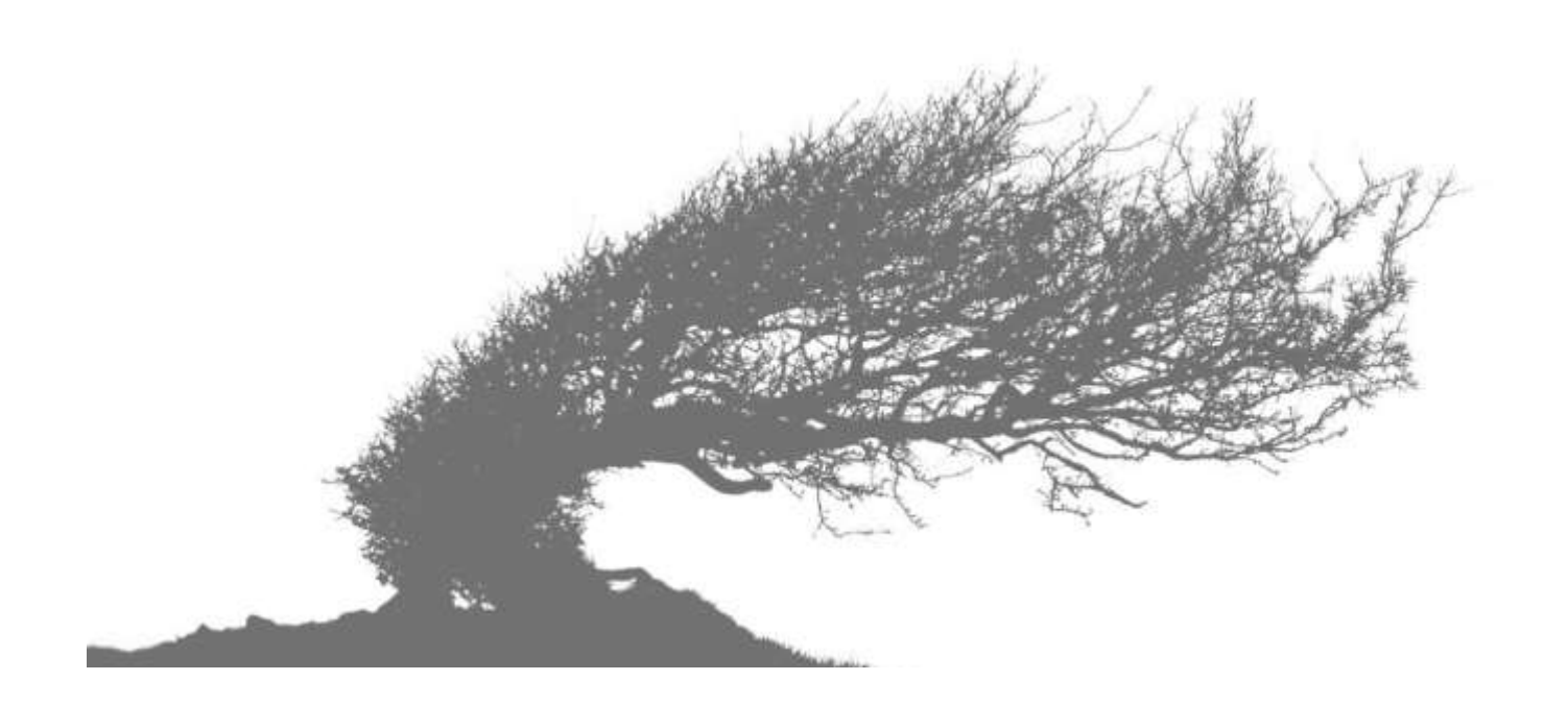
Braunton Parish Council Rural Community Energy Fund Stage 1 assessment