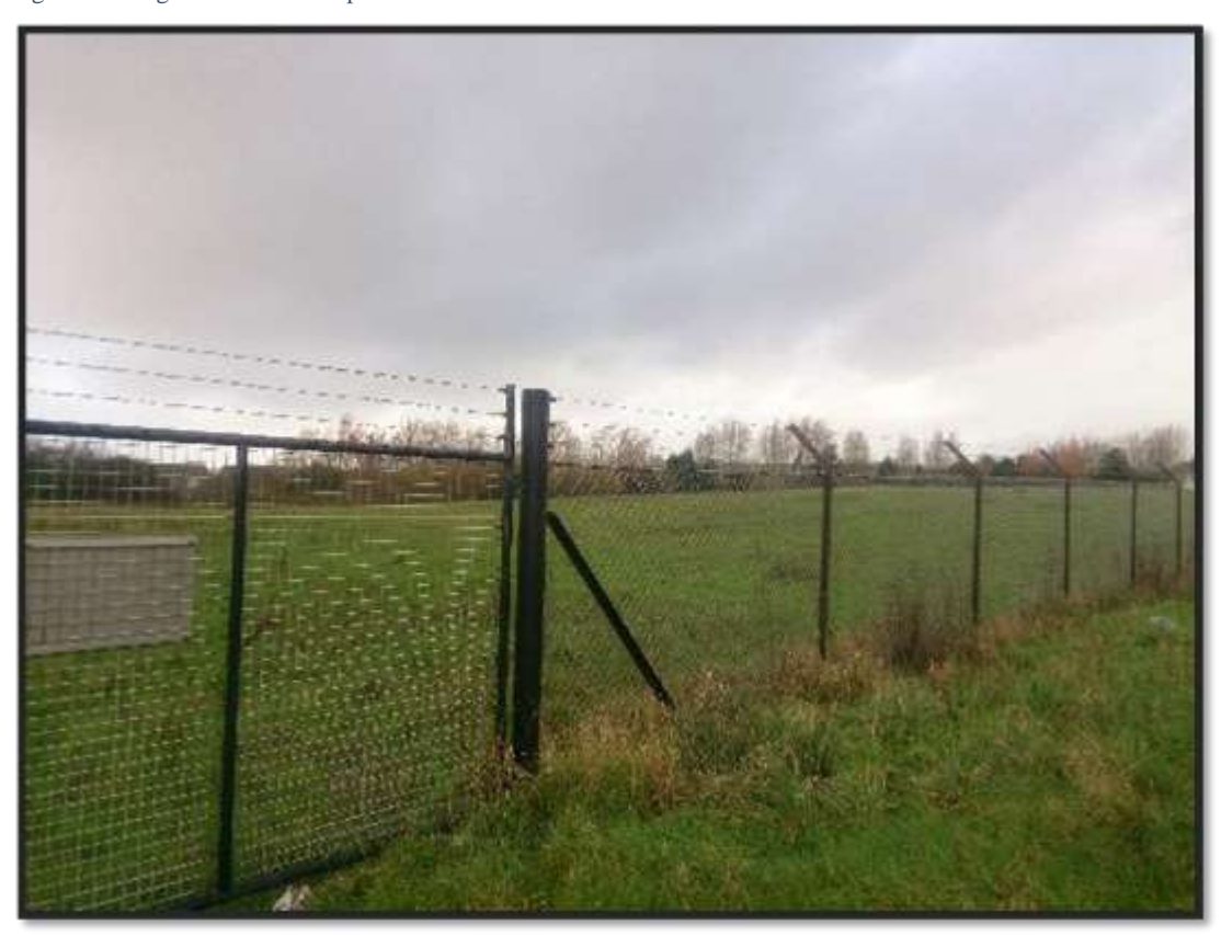
Figure 9 Perrigo small turbine option

This field is within easy connection distance to the main Perrigo building. The site would suit the installation of a turbine on a 15-30m tower, rather than that of a larger turbine.