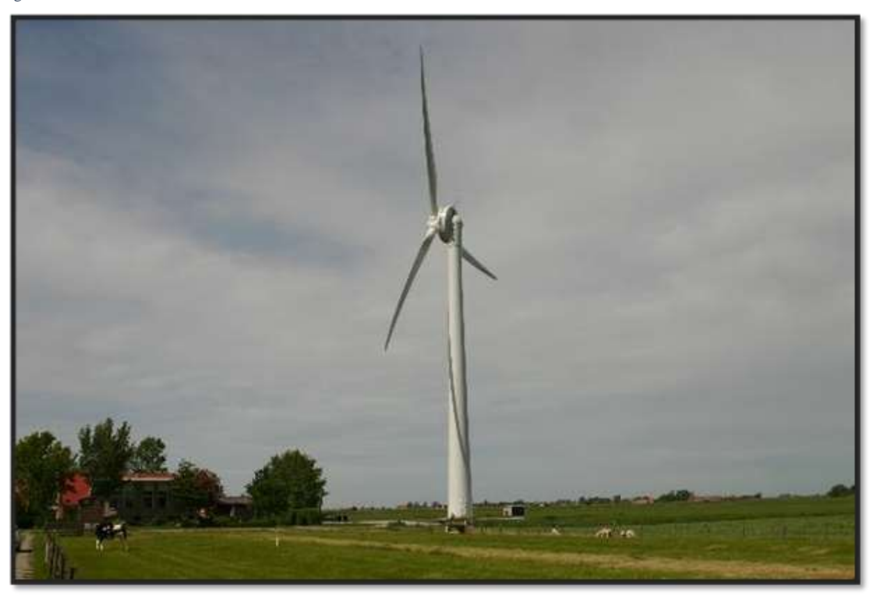
Figure 15 EWT 500 kW turbine

This size of turbine could be mounted on a tower of 40-50 metres and would have a tip height of around 65-75 metres.