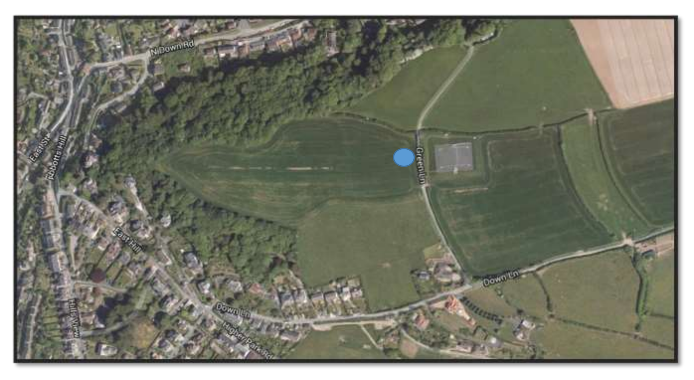
Braunton Parish Council, RCEF Stage 1 Feasibility. December 2015.