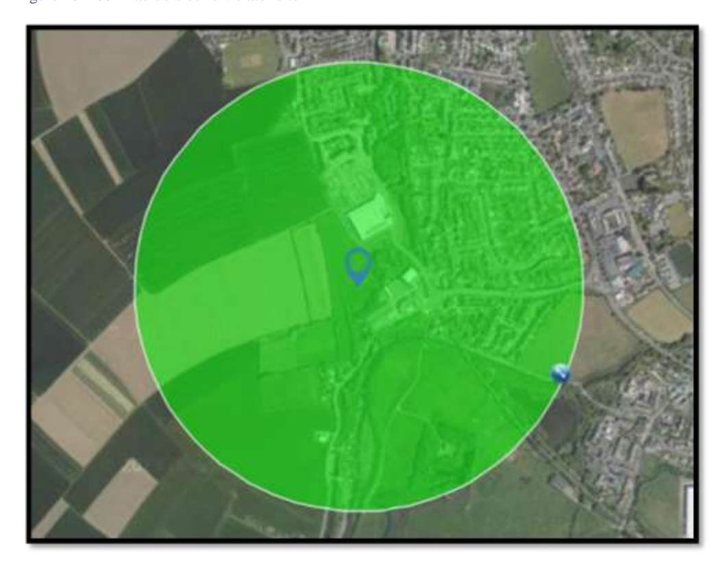
Figure 11 500m radius around Velator site