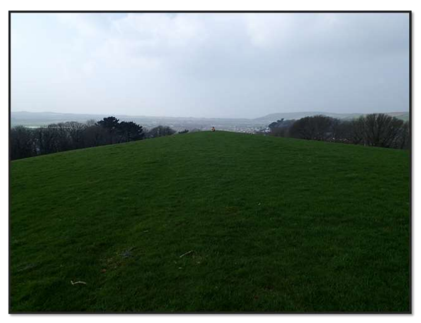
Figure 6 Green lane turbine location option