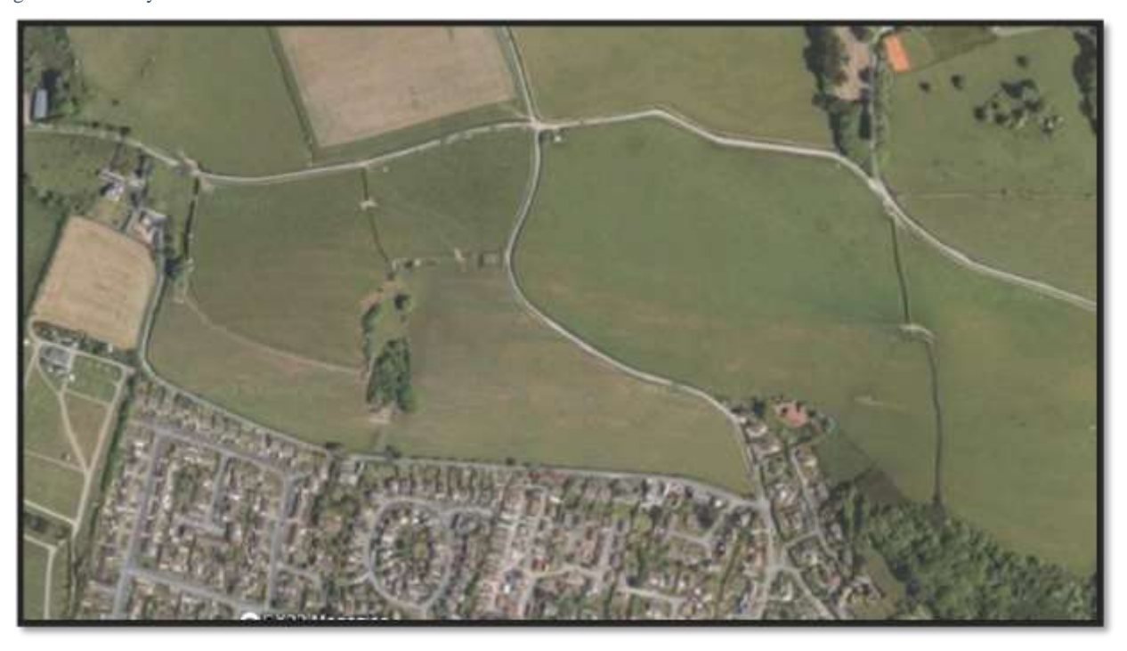
Figure 3 Willoway Lane transformer location

Smaller turbines could be located sensitively and be obscured from most parts of the village on these higher sites. A full visual impact assessment would be required. Full community support would be absolutely crucial to any project success.