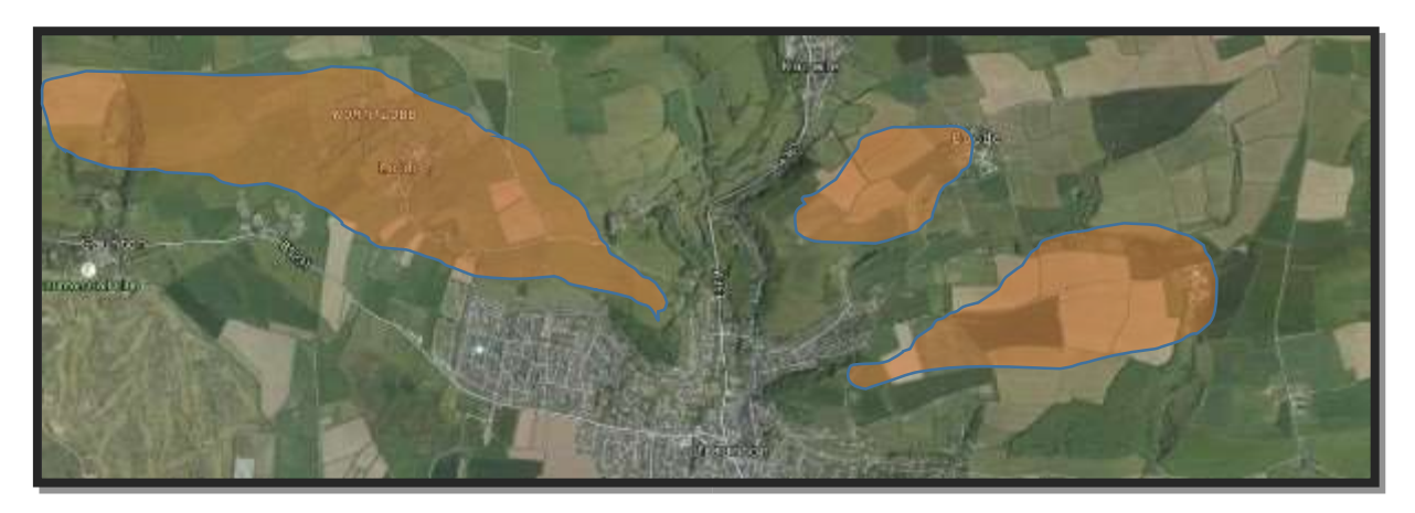
Figure 2 Areas of high average wind speed

There are no high demand electricity consumers in these higher areas around the village. Therefore a private wire connection to offset energy demand from a site of high demand may not be possible.