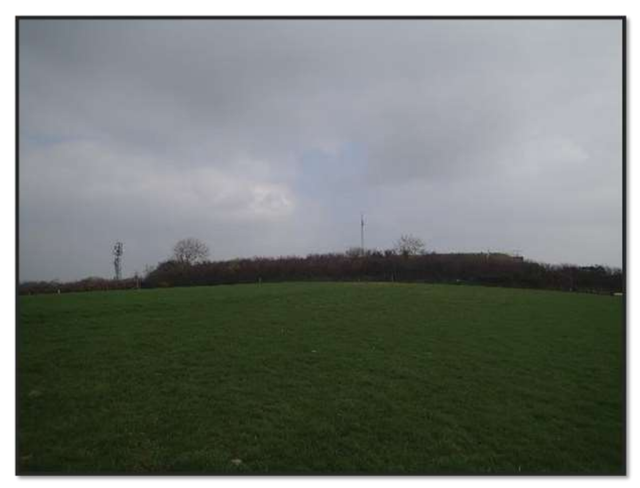
Figure 5 Green lane pumping station view to west