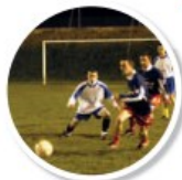
FOOTBALL GOAL R1308

Braunton was awarded £66000 in Section 106 funding from North Devon Council for the recreation ground. Some improvements have already been made including tree planting.