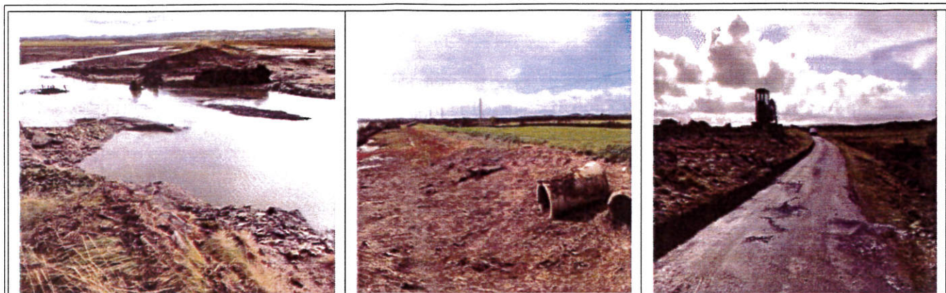
Horsey Bank breach as at 02 10 2019