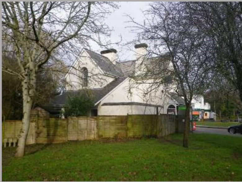
Figure 3 Newsagent south facing roof space

The south facing aspect of the newsagents can be seen in this photo. It is a small roof with little space and is shaded by nearby trees.