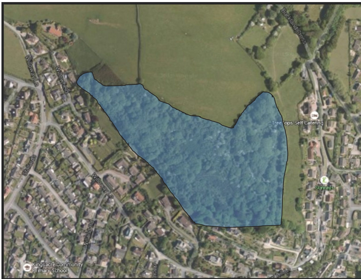
Figure 7 The Beacon woodland area