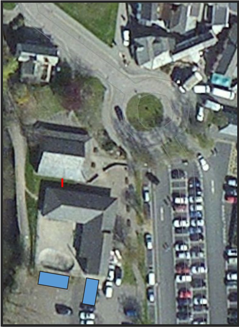
Figure 5 Surf museum and countryside centre heating system options

The best location for a plant room is at the southern end of the surf museum. This would take up a small area of car park. The location would allow easy delivery of fuel and sufficient space for boiler and fuel store.