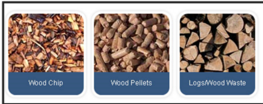
Figure 1 wood fuel types

Wood fuel is low carbon – when wood is burnt it emits the same amount of CO 2 into the atmosphere as absorbed during the life cycle of the growing plant. It is important to recognise that it is not carbon neutral because there are emissions from transportation and processing. However, the emissions are significantly lower than for fossil fuel heating systems, especially if the fuel is obtained from local woodland. There are also economic and ecological benefits if local timber is used.