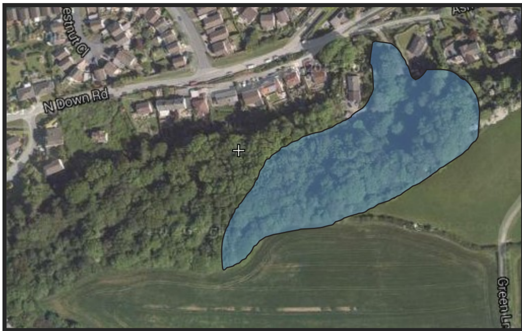
Figure 9 The old quarry woodland area

The old quarry site is a small piece of woodland owned by the PC on the hilly ground to the east of the village. The woodland is on a slope of a hillside, near to residential properties.