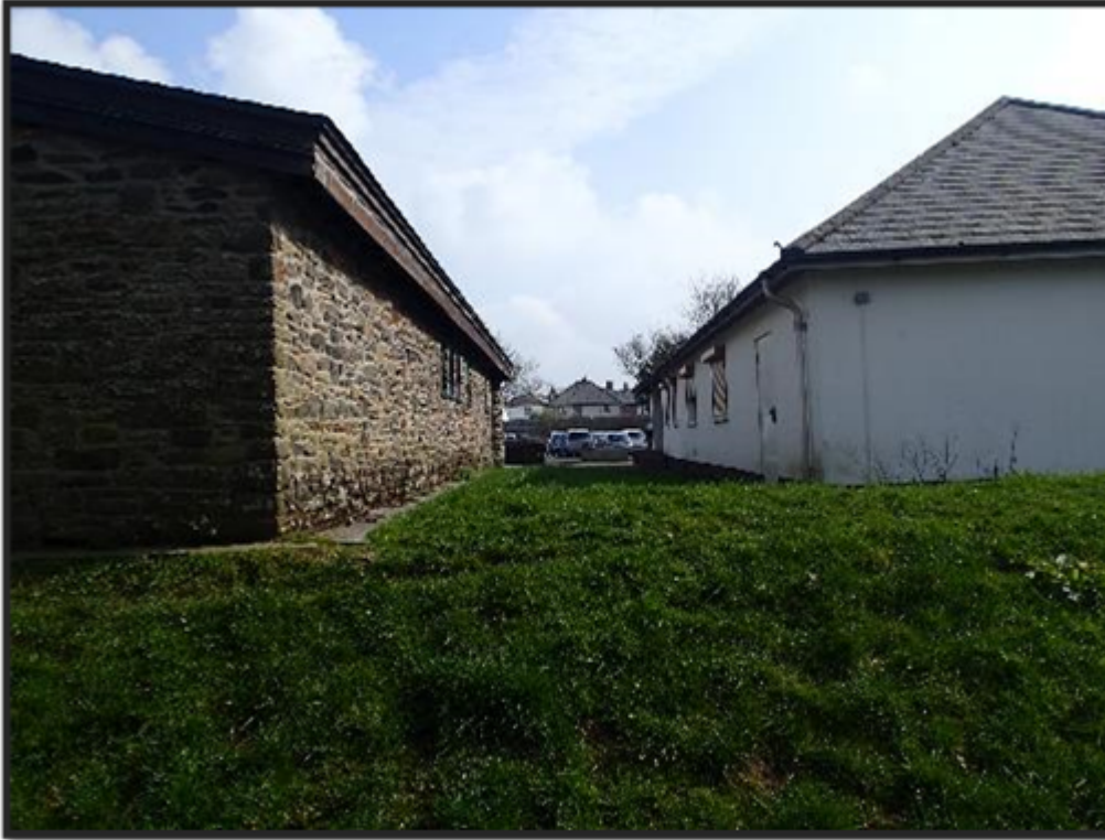
Figure 6 Space in between surf museum and countryside centre

The small gap between the surf museum and countryside centre.