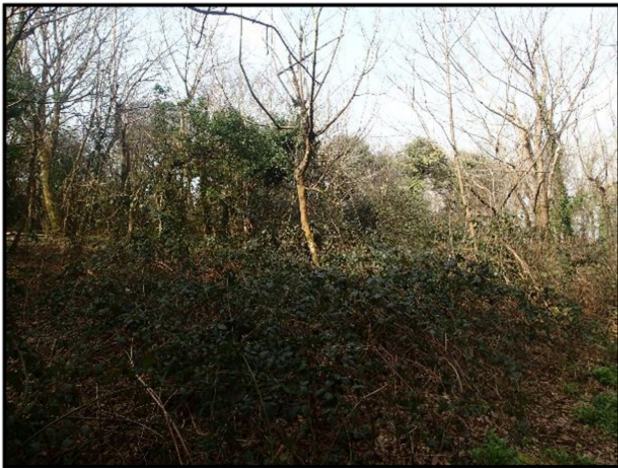
Figure 8 Beacon unmanaged woodland example